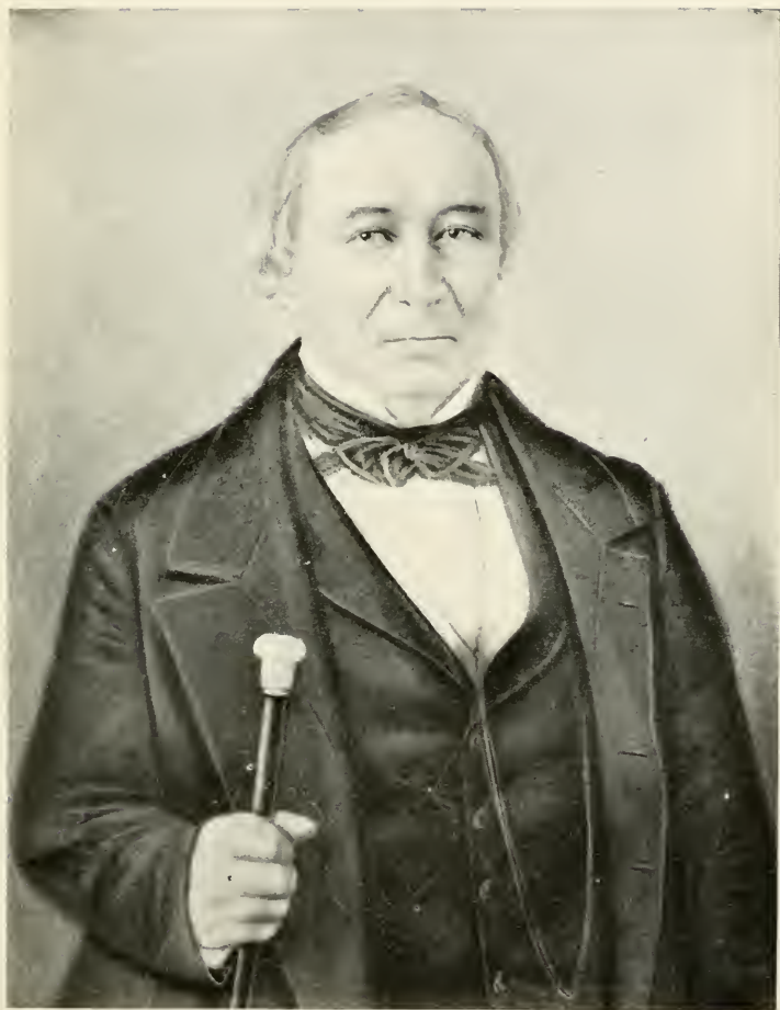
HON. SAMUEL CHURCH. Chief Justice of Conn.